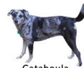
Catahoula Leopard Dog