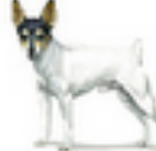
Toy Fox Terrier