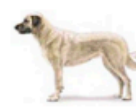
Anatolian Shepherd Dog