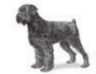
Black Russian Terrier