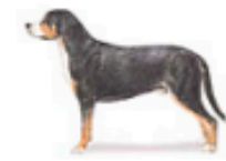
Greater Swiss Mountain Dog