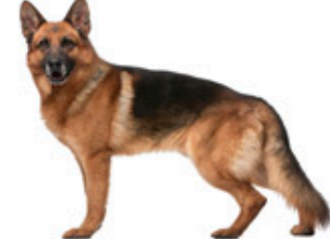
German Shepherd Dog