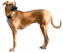
Black Mouth Cur