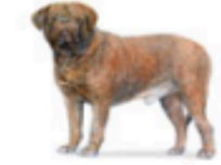
Dogue de Bordeaux