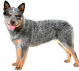
Australian Cattle Dog