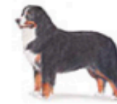
Bernese Mountain Dog