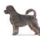
Portuguese Water Dog